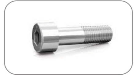
Socket Head Bolt