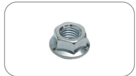
Hex Flange Nut