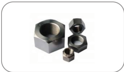
Hex Head Nut