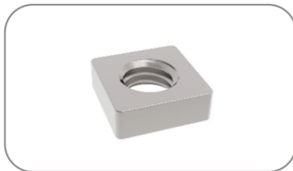
Square Head Nut